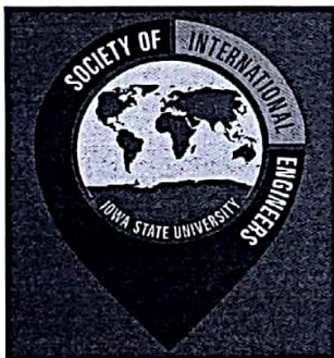
Society of International Engineers logo

The Society of International Engineers, often abbreviated as SIE + , is a group of engineering students at Iowa State University looking to build a strong community of international engineers + ("About"). The society welcomes and represents both international and American students from all parts of the world, and provides a gathering place for engineering students to bond and form friendships during events and general meetings + ("Events"). Very recently, SIE held an American Flag Football Event on September 23 rd to introduce new international members of SIE to American football. The ultimate purpose of these events is to provide hospitality to international exchange or transfer students in the College of Engineering ("Student Organizations").